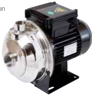
PUMP PERFORMANCE: — MS100/1.1 — MS100/0.55

304 Stainless steel range: Clear non-aggressive liquids Stainless steel construction.