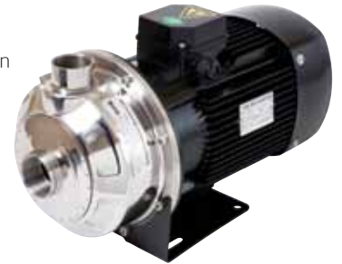
PUMP PERFORMANCE: — MS250/1.5 — MS250/2.2 — MS330/2.2

304 Stainless steel range: Clear non-aggressive liquids Stainless steel construction.