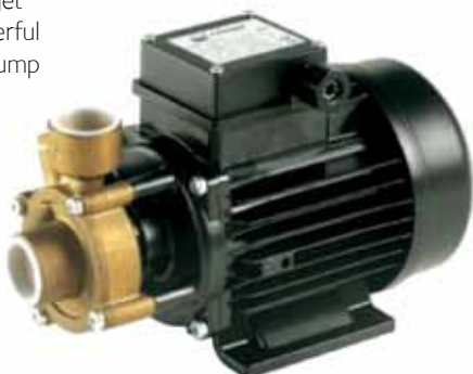
PUMP PERFORMANCE: — HF40